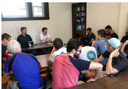
LEFT: CHI PHI ALUMNI DURING FALL 2019 REUNION & HOMECOMING